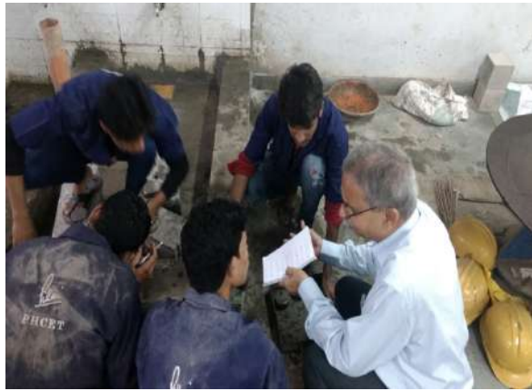
Exams carried by MSSDS officials. Have attached their video, too.